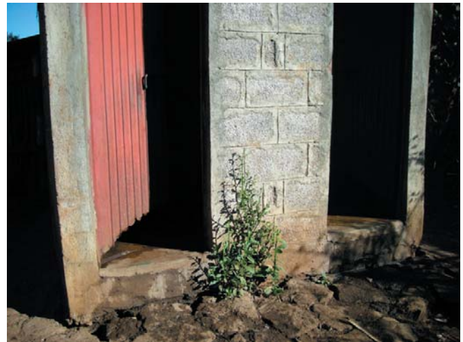
In urban areas, where facilities are often shared, stigma can still be an impediment to latrine use for PLWHA.

In rural areas, easy access to land was an important factor that led to the construction and use of the Ecosan