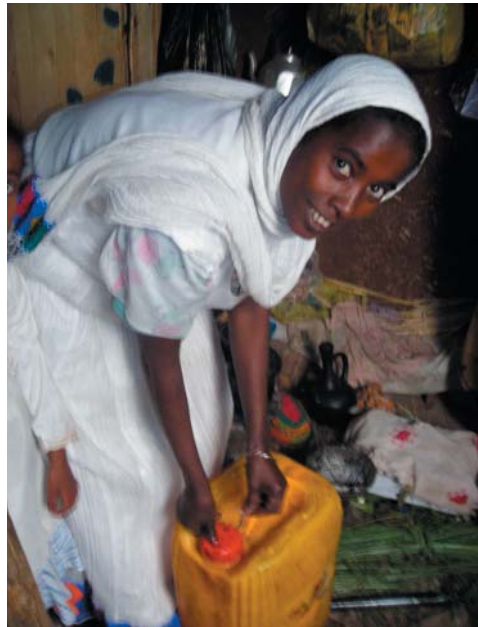
Among the practices negotiated with TIPs participants was switching to a narrow mouthed 20-liter jerry can for water treatment and storage.

recommendations on the WASH-related SDA to be integrated into home-based care programs in Ethiopia.