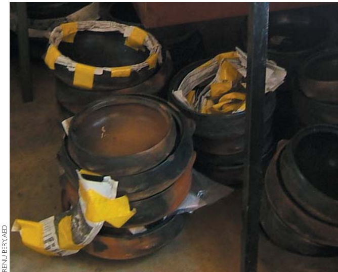
Researchers observed adaptations such as these home-made bedpans as one method that caregivers used to keep a clean environment for bed-bound patients.